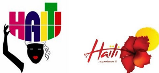
Figure 5: Old And New Logo Haitian DMO

It is worth highlighting the fact that the understanding/knowledge (or not) of a destination impact on how this destination is perceived by potential visitors (Li, Lu, Ying, Jiang, Barnes & Zhang, 2014). Hence the reason why Li et al (2014) suggested that it is important to investigate how much visitors know about the destination. Cognitive and affective image are important when it comes to decision-making (Li et al , 2014).