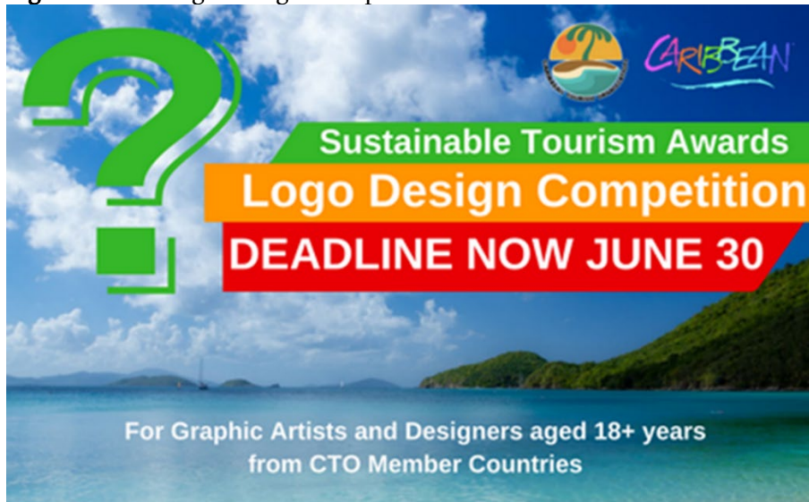
Figure 3: Cto Logo Design Competition