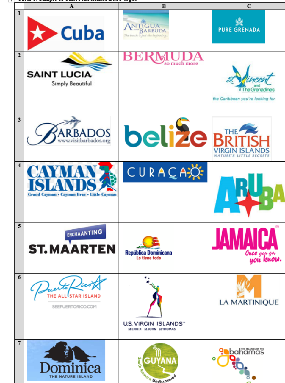
Table 1: Sample of Caribbean islands DMO logos