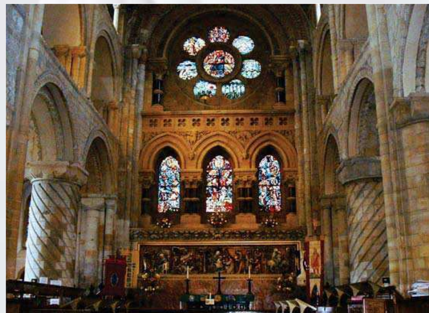
Interior view of the east window of Waltham Abbey, Essex, UK: venue for the première performance of Kyrie.