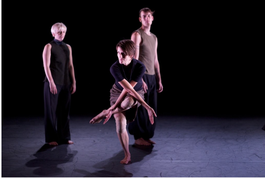
Figure 15. The Living Room (Section two), Photography: Chris Nash Roehampton University, 3 March 2011, Centre: Szydlak