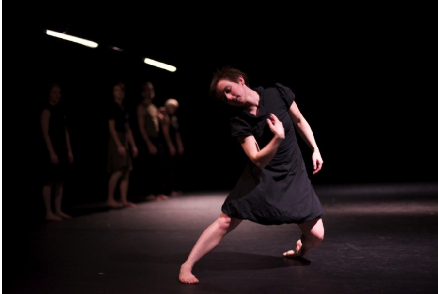
Figure 17. The Living Room ('Vortex', McConville's solo repeated) Photography: Chris Nash, Roehampton University, 3 March 2011

The text for my solo in The Living Room also reveals nuggets of personal information, often in poetic form but as in McConville's solo, never a full 'life story'. Equally the movement and its performance can be seen as personal, yet it is primarily constructed through quoting short phrases performed by the other dancers in their solos and recognisable movements and iconic images from Nijinsky, Graham and De Keersmaeker's Rosas Danst Rosas (1983). Thus a notion of the personal or biographical is underscored by quotation, reaffirming my position as not only 'woman' but also 'artist' in the task of constructing a self-portrait. The use of repetition (through quotation, direct movement repetition and spatially through the continual return to the spot where the solo began) points to the process of construction and my role as 'constructor', choreographer.