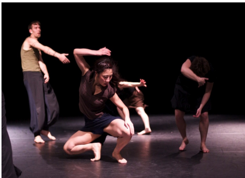
Figure 22. The Living Room (‘Vortex’- non-uniformity) Photography: Chris Nash, Roehampton University, 3 March 2011

The piece’s clever structure winds through moments of ensemble unison, a scattering of limbs as one dancer thrusts her arms towards the other bodies, and duets emerging from contrasting phrases. That unison is occasionally rough around the edges...but that roughness adds to the authentic feel of the work, vitality and energy coming from the stage as dancers attack their phrases. (Smith 2010; online)