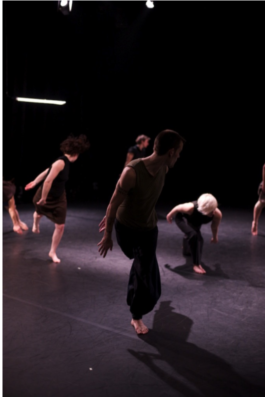
Figure 23. Left

The Living Room ('Vortex') Fleeting moments of unison