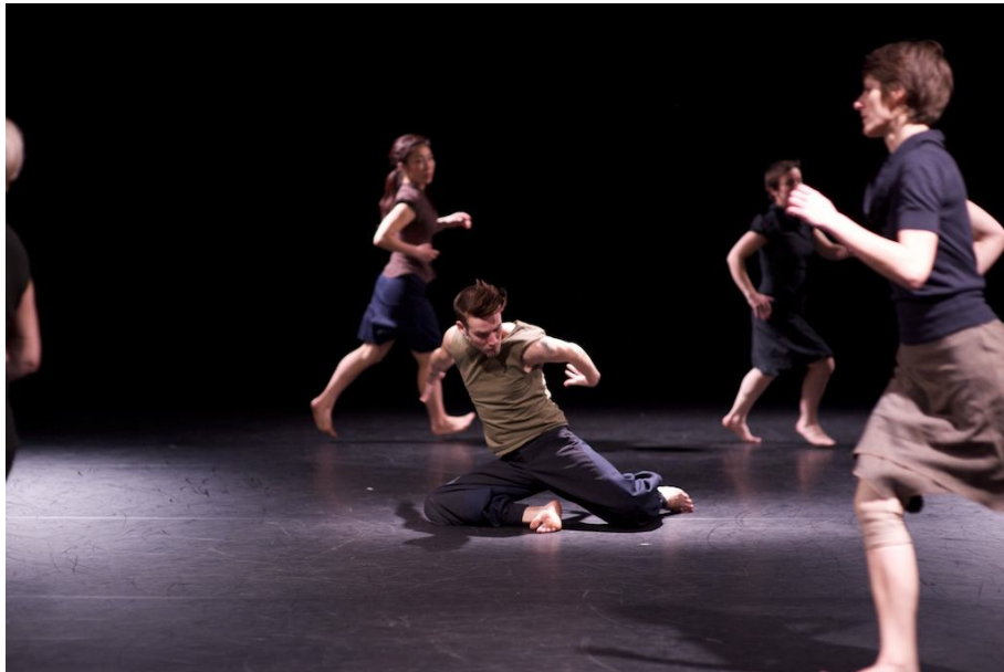
Figure 13. The Living Room (‘Vortex’) Roehampton University, 3 March 2011, Centre: Birch

minimalist, stripped-down fashion, with dancers only performing the actions of walking or running. Compositionally they deal with the spatial and temporal configurations inherent in the circle as well as the meanings that emerge in the playful and sometimes predatory dynamics inherent in the dancers chasing one another. The main circling section in The Living Room , ‘the vortex’ is similar to these works in investigation of spatial structure, but exhibits more formal choreographed dancing.