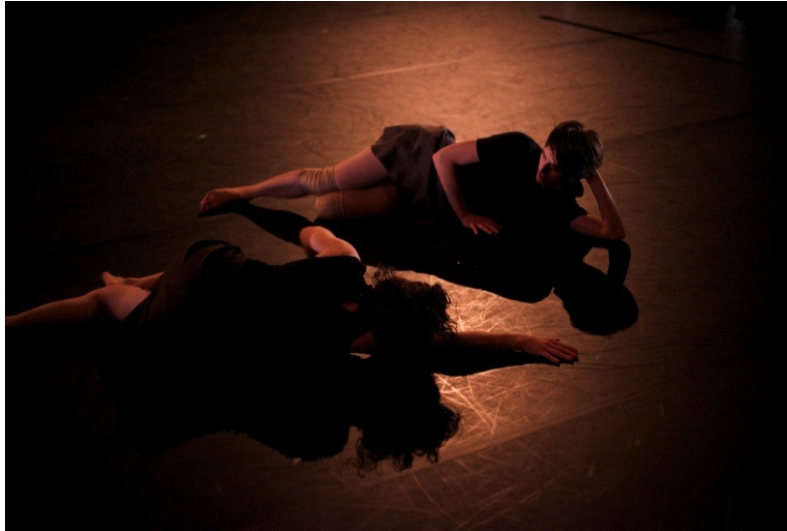
Figure 20. The Living Room (duet), Photography: Chris Nash, Roehampton University, 3 March 2011, Centre: Szydlak & Mortimer

performed in unison yet one becomes distinctly aware of the difference between the dancers as well as the significance of gender difference. The ‘guest duet’, performed by two women, is clearly intimate, sensual and at times even sexually charged (Figure 20, p.163). However, as the other two dancers, one Male and one Female, enter to form the quartet, the audience’s reading is reframed, shifting the intimacy and apparent sexuality the earlier duet suggested.