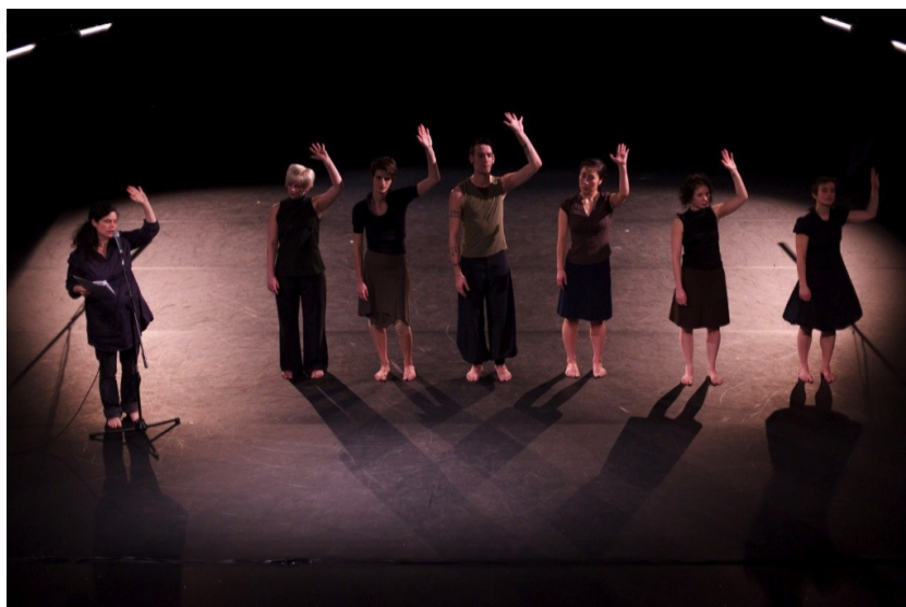
Figure 18. Left, The Living Room ('Voting'), Roehampton University, 3 March 2011, the company

The Living Room is profoundly interested in establishing connectivity with its audience and in interrogating its discursive potential as much as its choreographic or aesthetic concerns. Whilst the portraiture of the dancers throughout the work touches on the in-between private and public constructions of identity, the voting highlights Bhabha's insistence on cultural differentiation as well as pointing to complex constructions of identity within a social and communal sphere.