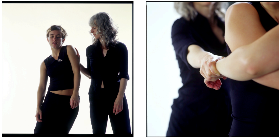
Figures 5 & 6. Shrink'd (publicity shots), Photography: Chris Nash. McConville & Kendall

This three-dimensionality also freed me compositionally, creating complexity of angles and lines, both those contained within the dancer's individual architectural or skeletal frame and the intersecting lines and trajectories created through their moving bodies viewed in relation or in contact with one another. In addition the 'horizontal plane' offered a revealing intimacy, an almost 'private' view, which is difficult to achieve within conventional presentational performance (Brown 2010, p.64).