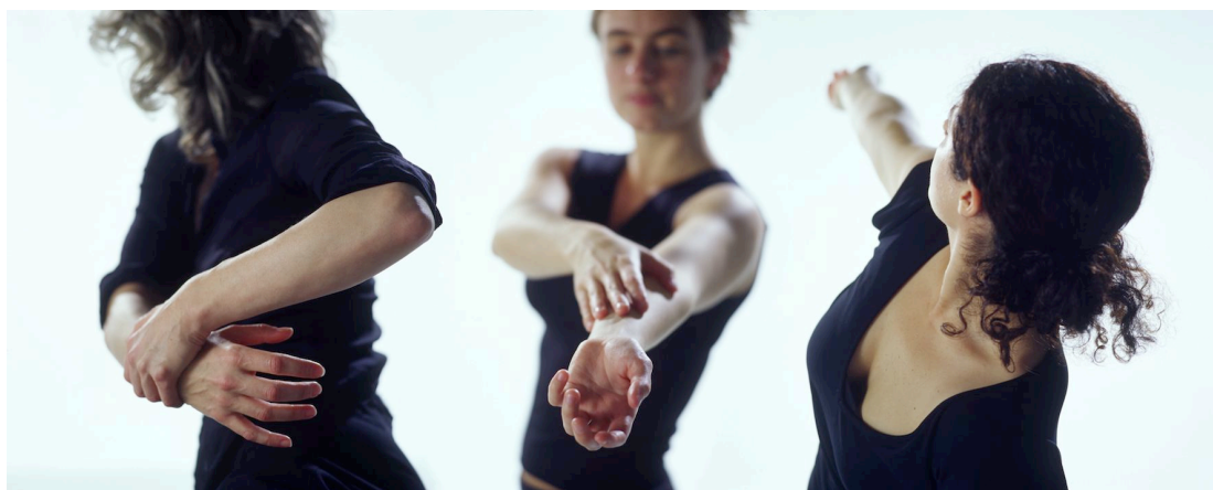
Figure 4. Shrink'd (publicity shot) Left to right: Kendall ('Kitty'), McConville ('Ducky') & Flexer

These same choreographic concerns underlie the research in Shrink'd , an interest in the physical and anatomical intricacies of the body experienced at close proximity as well as the three-dimensionality and sculpting of the body offered within an enveloping viewing situation. In terms of movement language the 'in the round' framing 'democratised' all parts of the body, the back of the body equally important to the front, the detail or 'close up' of a hand equally important to viewing the whole of the dancer.