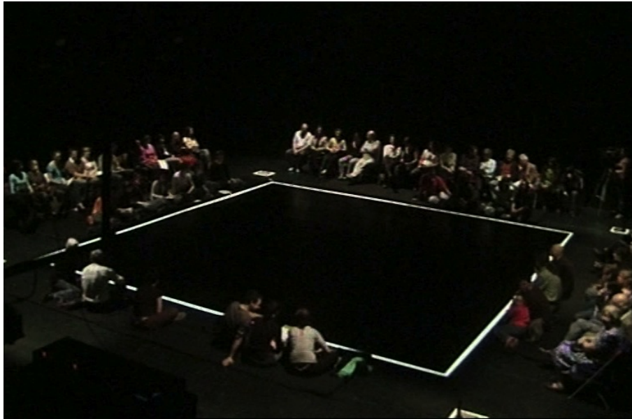
Figure 1. Shrink'd Video Still, The Place Theatre, London, 29 April 2006, audience in view and a square lit border

the performance space, their placement creating the boundaries of the area in which the performance took place (Figure 1, below). This configuration was a response to a choreographic concern central to Shrink'd , the desire to generate a sense of intimacy between performers and viewers.