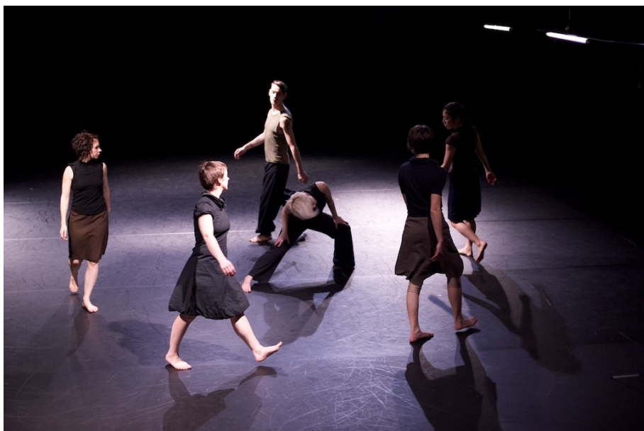
Figure 14. The Living Room (‘Vortex’) Roehampton University, 3 March 2011, Centre: Martin