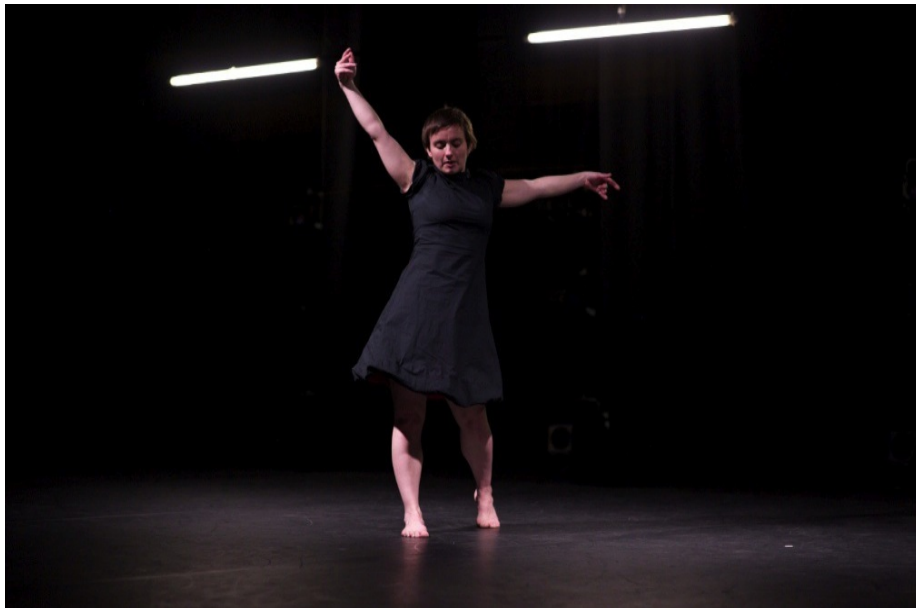
Figure 19. The Living Room (McConville's solo), Photography: Chris Nash Roehampton University, 3 March 2011.

thought as it overlaps, sometimes blending with, and sometimes wandering away from their moving body? (Figure 19, below)