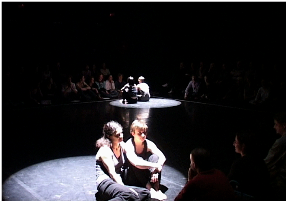
Figure 2. Shrink'd Video Still, The Place Theatre, London, 29 April 2006, face-to-face encounter.

One of the sections in Shrink'd literally involves a face-to-face encounter with audience members, performers standing or sitting and making eye contact with specific members of the audience (Figure 2, below). This section is repeated in reverse at a later point in the work with performers seeking out and trying to re-establish eye contact with the same audience members. Similarly, Doing, Done & Undone , and to a lesser degree The Living Room , also involve distinct moments of direct eye contact or facing of the audience. These are marked out from the more abstract, primarily compositional movement sections of the works, through relative stillness (performers standing in an everyday stance) and silence, allowing for resonance in the encounter between performers and audience members.