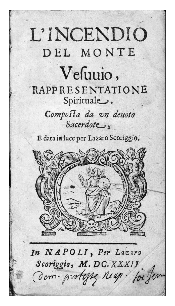
Fig. 6. Anonymous, L'incendio del Monte Vesuvio. Rappresentatione spirituale , Napoli, Lazaro Scoriggio, 1632 frontispiece. Shelfmark: The Johnston Lavis collection, Shelfmark: Shelfmark: JL. 1632 G5.