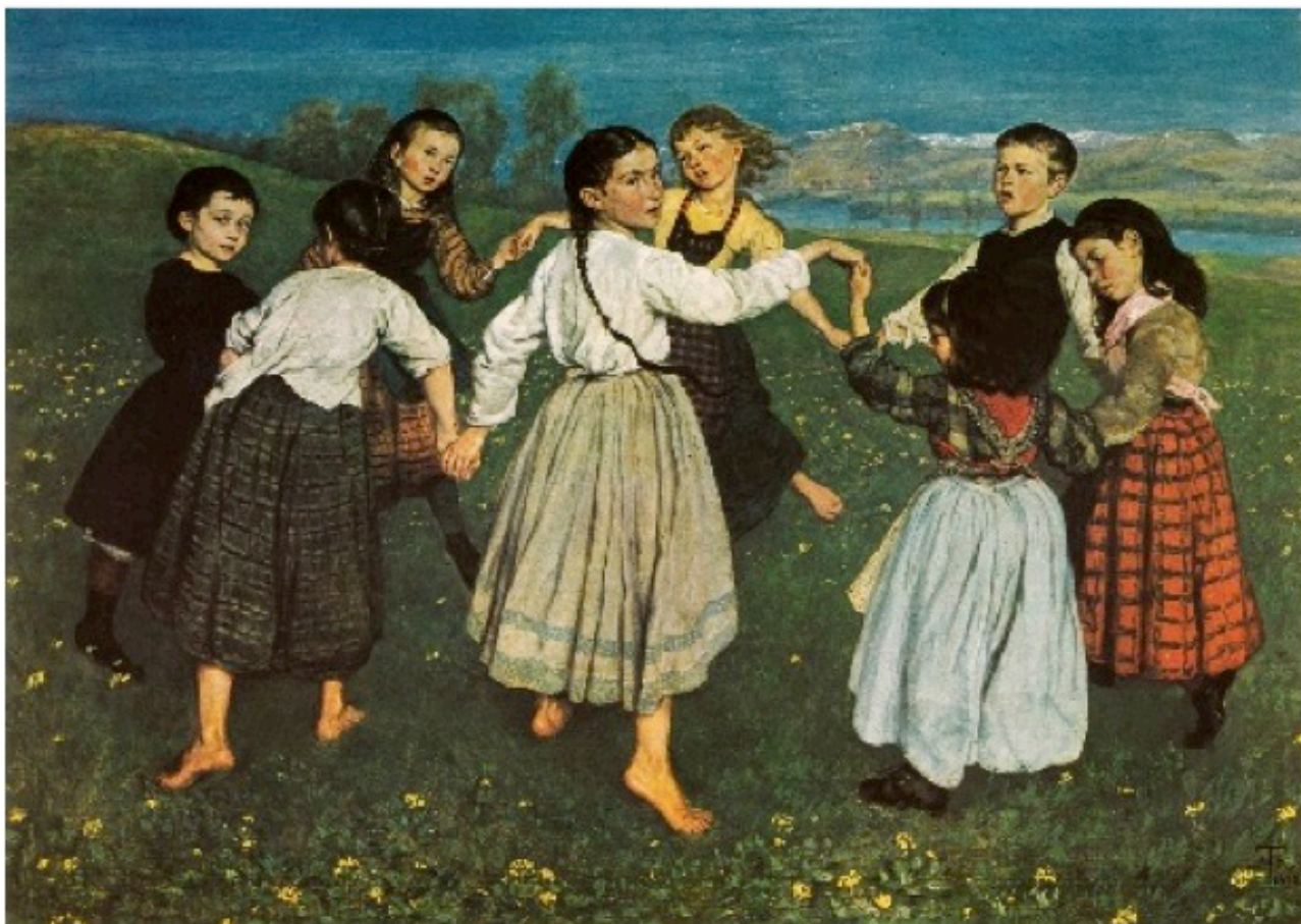
Children dancing in a ring (Der Kinderreigen), 1872: Hans Thomas [1839-1924]. Staatliche Kunsthalle, Karlsruhe.

From an organisational perspective, how can we form more trusting relationships with and between people on a larger scale: teams, departments, organisations, sectors, communities of practice - the mêlée of what aspires to become a thriving society? How can we create, sustain and nourish appropriately trusting relationships? What conversations and actions might we encourage to facilitate this?