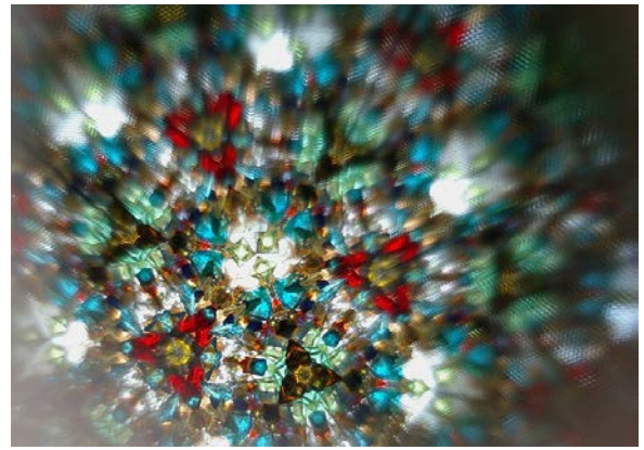
Kaleidoscope view : Picture by Muu-Karhu

In our attempts to understand trust better, we are drawn to the metaphor of playing with a kaleidoscope . We see that kaleidoscopic images are made up of hundreds of reflected shards of coloured glass. However, our attention is drawn to the bigger patterns of colour and uniqueness. We are aware of how the larger picture is formed from the fragments, but this comes to life and patterns change every time it is turned and we sense a process of movement and becoming.