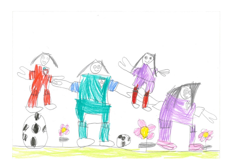
Figure 4. Zoe's picture of being active at home

Zoe explains her family interest in football: