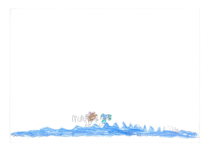
Figure 2. This is me and mummy going swimming at the weekend at the beach and I like to play tag with my mummy at the beach.

Similarly, Bradley's (boy aged 5yrs) colours are consistent with expectations of a boy's drawing, but the high level of detail, not (Figure 3):