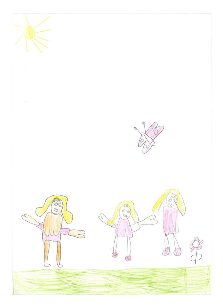
Figure 5. We're running away from Ben – we always play a game together and he gets to chase.

This is therefore illustrative of gendered identities being complex, and/or fluid not only over time but in terms of contexts. Therefore, where there are more convergent expectations of gender, Zoe is compliant with these.