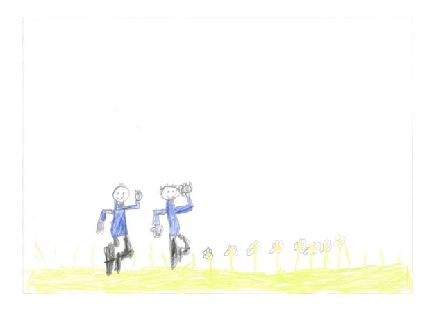
Figure 1. This is me with Zach, I'm playing on the field.

This first drawing exemplifies how there was evidence that children incorporated contrasting gender signifiers in their drawings and therefore their experience of physical activities. The existence of combined gendered indicators was seen in interactions of content, colour and detail. This is a Reuben's (boy aged 6) picture of being active at home (Figure 1):